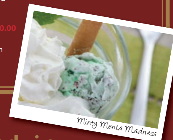
Minty Menta Madness

STRESSED... spelled backward is ...DESSERTS